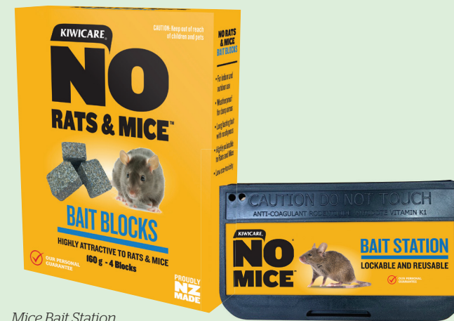
Mice Bait Station