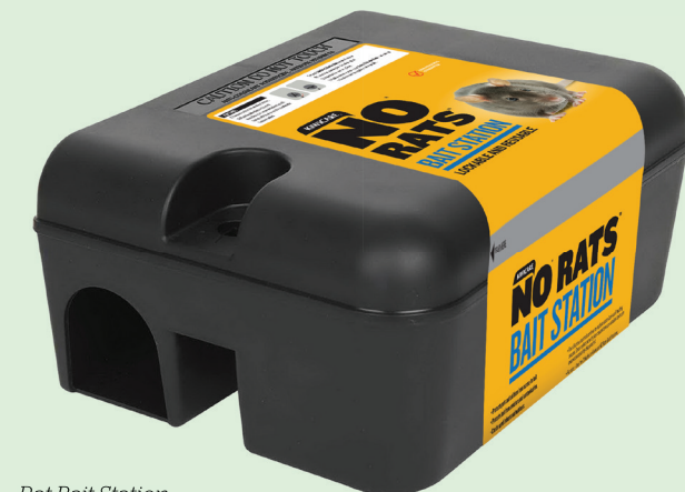
Rat Bait Station